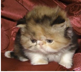
Caziggi's Frontpage Mews